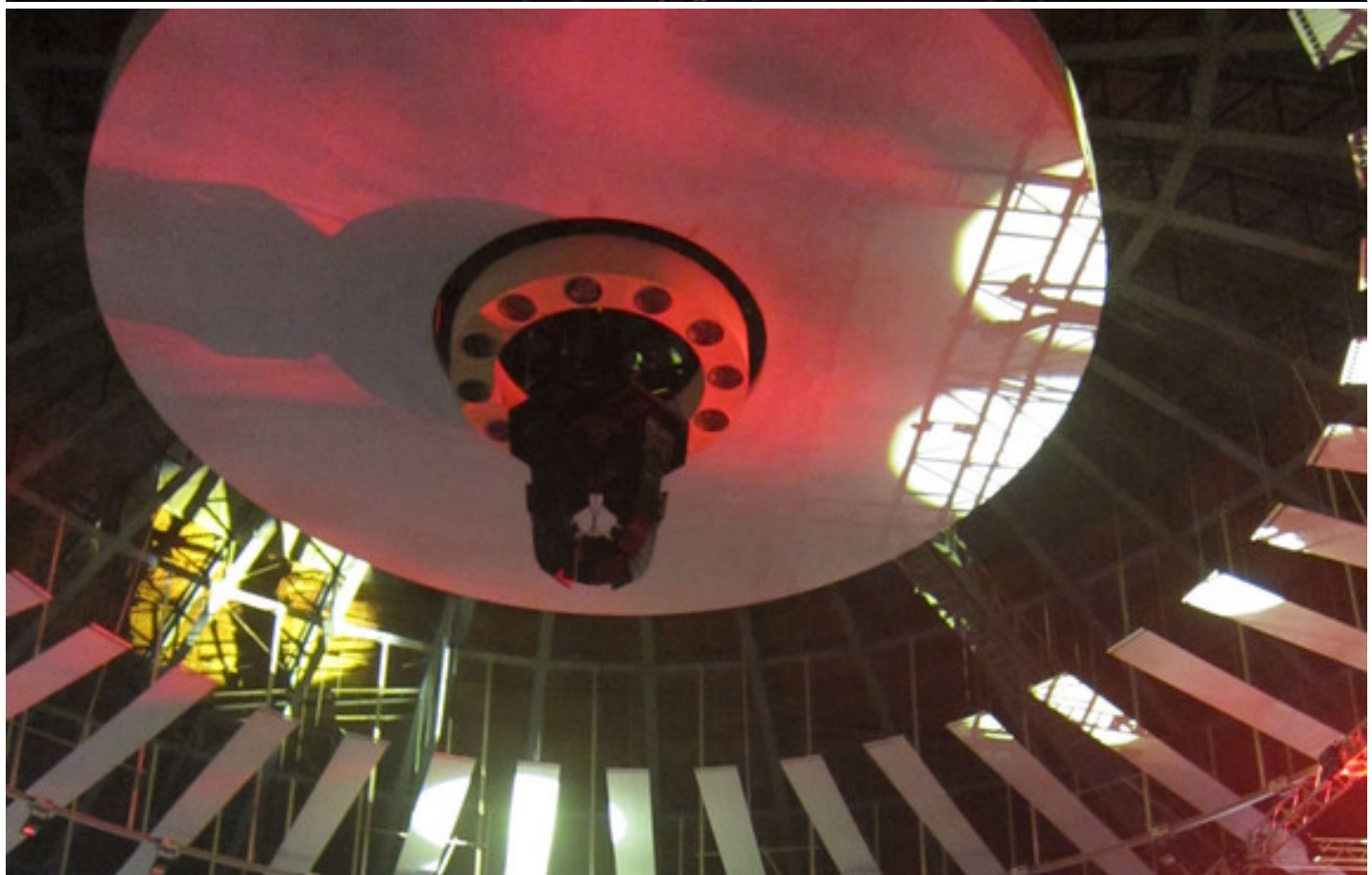
Robe MMX Lights the Stars in Korea