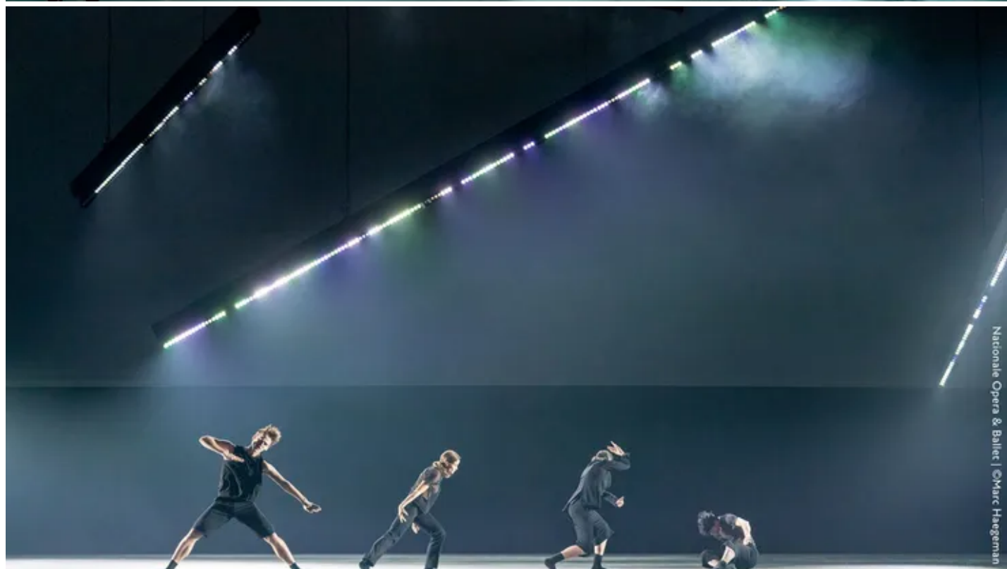
Nationale Opera & Ballet