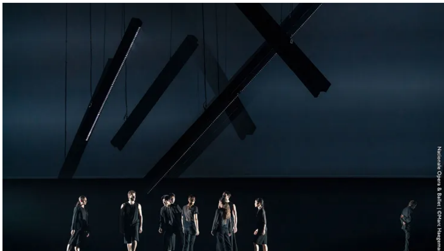
Nationale Opera & Ballet