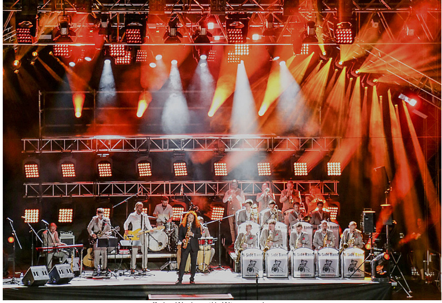
Robe Works with Winners at 2016 UCI Mountain Bike World Championships