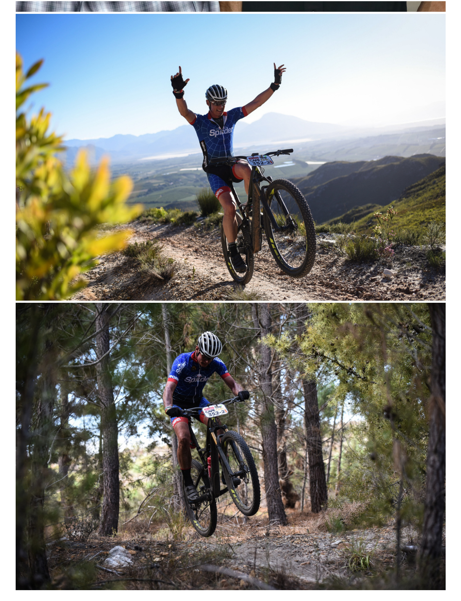
Team Spiider Crosses The Finish line