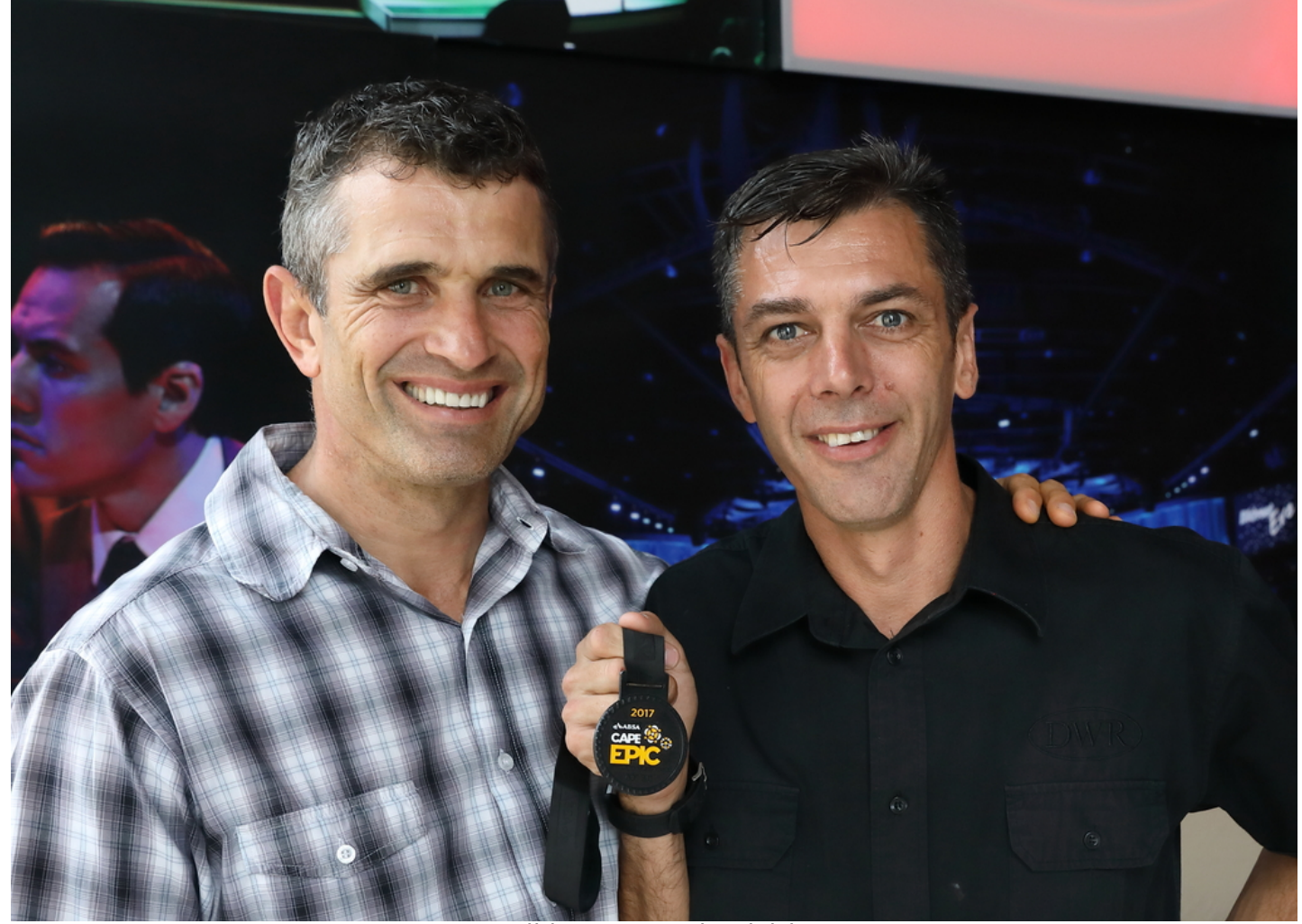
Team Spiider Crosses The Finish line