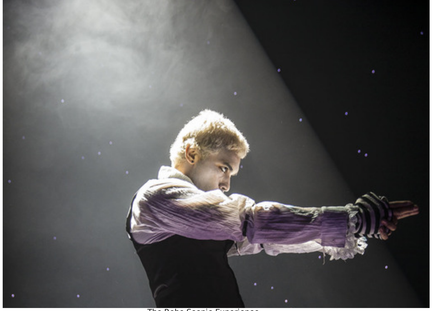
The Robe Scenic Experience Rocks at Prolight 2016