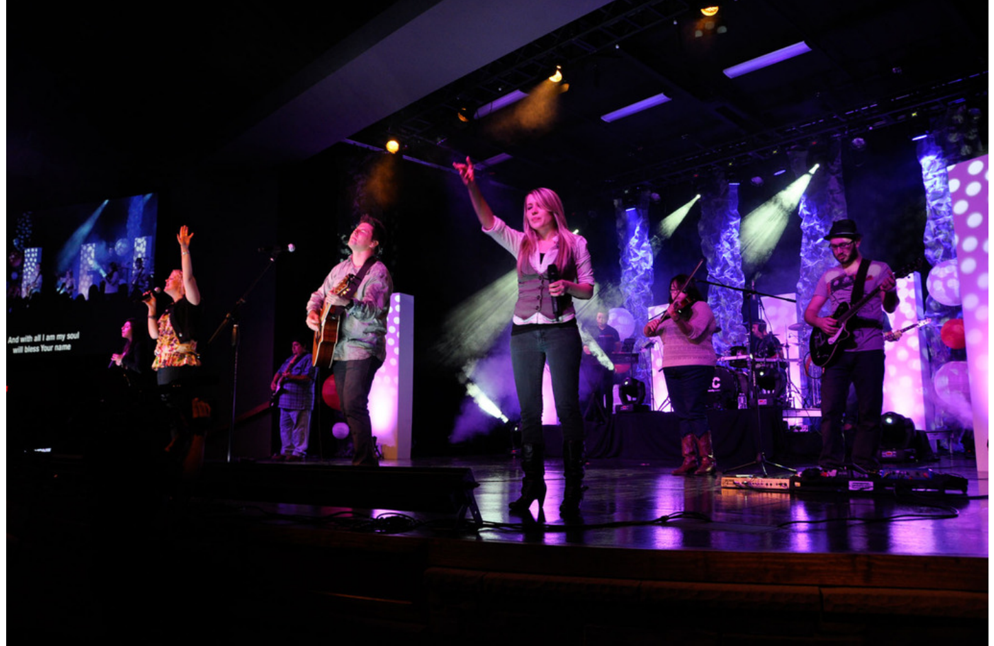
Robe Installed at New McAllen Family Church Auditorium, Texas