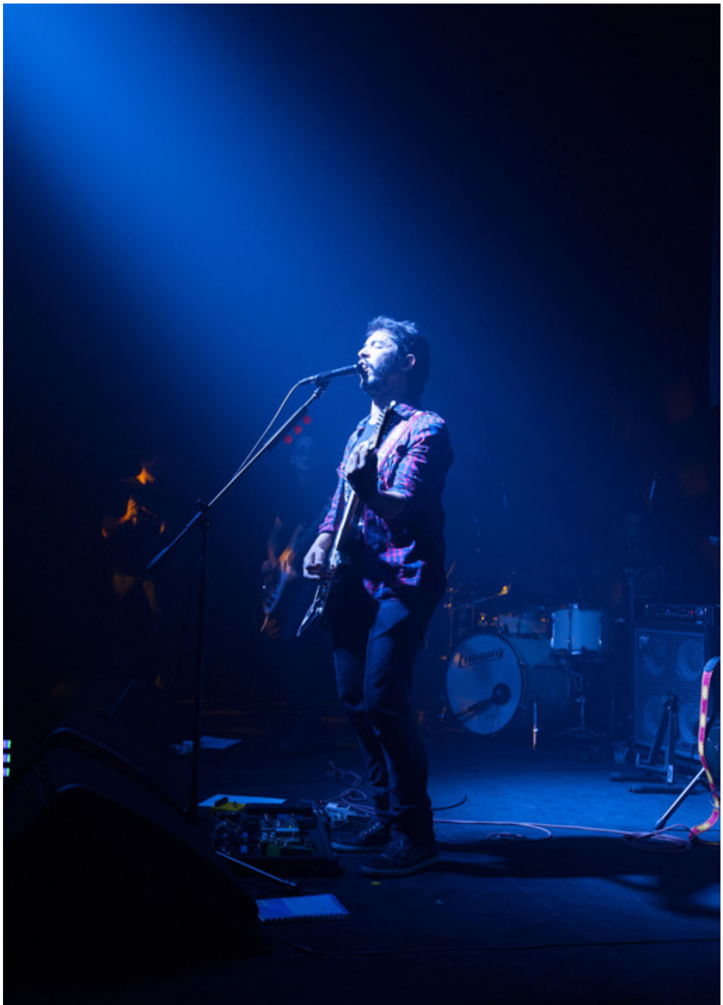
Robe Makes Impact in Colombia!